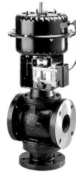
MP84 Actuated VG2000 Valve