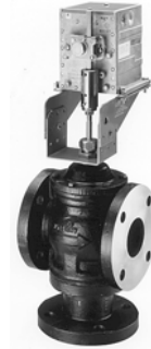
M100 Actuated Three-Way VG2000 Series Valve