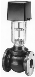
VA-3100 Actuated Two-Way VG2000 Series Valves