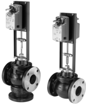
M9100 Non-Spring Return Actuated VG2000 Valves