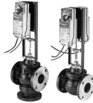
M9220 Spring Return Actuated VG2000 Valves