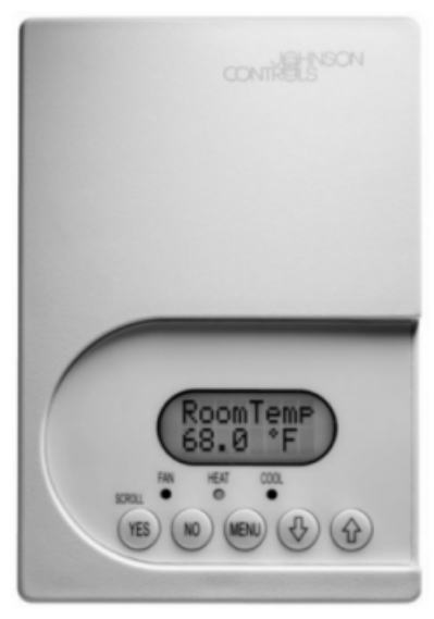
T600xxx-3 Series Thermostats