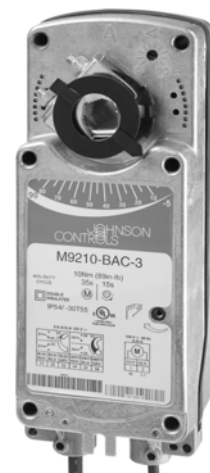
Figure 1: M9210-xxx-3 Electric Spring Return Actuator

The M9210-xxx-3 Electric Spring Return Actuators provide running and spring return torques of 89 lb-in (10 N·m). Integral line voltage auxiliary switches are available on the xxC models to indicate end-stop position, or to perform switching functions within the selected rotation range.